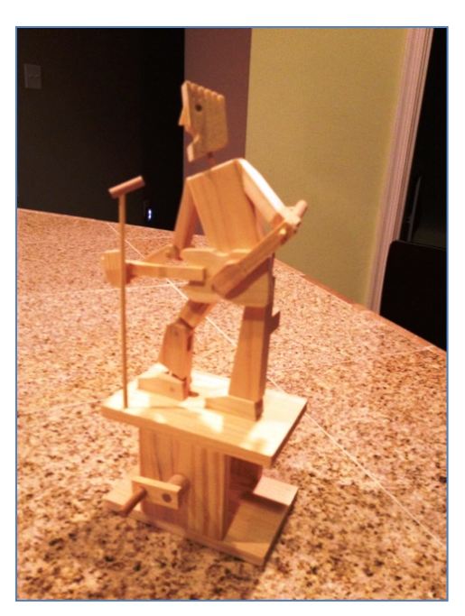
The theme for this simple automaton is Fun with Music. When you turn the crank, the guitar player taps his leg and the arm strums the strings!

Automata: A Design & Technology Toy Challenge